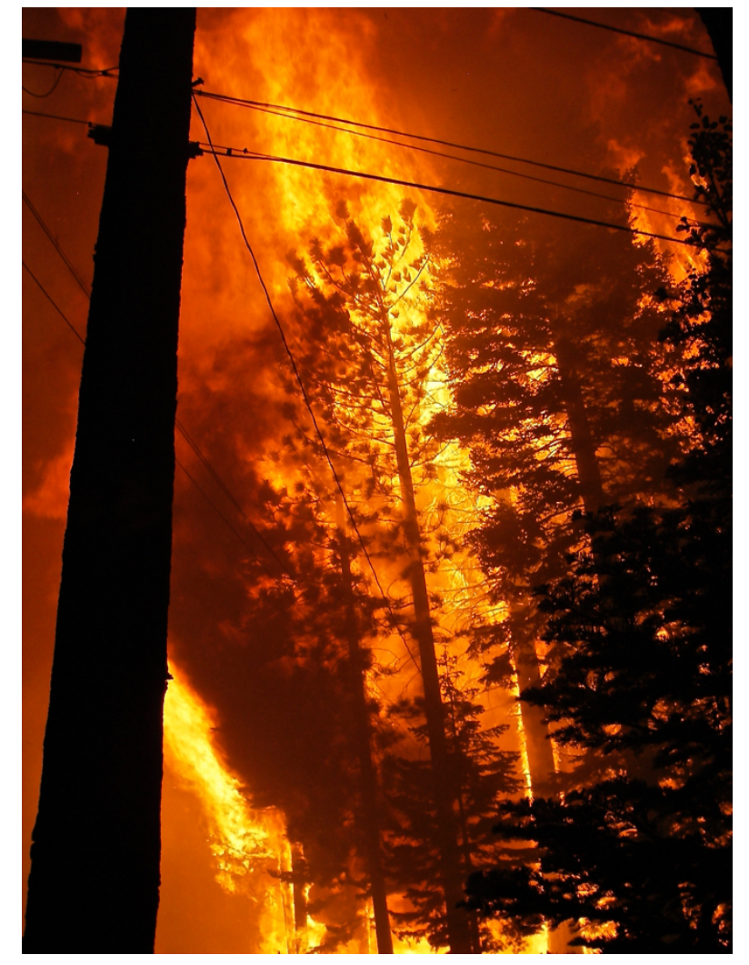
The Angora Fire burned hot and intense in the tree canopy.

Fire behavior is very different between treated and untreated terrain. If it's been thinned, then the fire tends to say in the understory where it is more easily suppressed. Fighting a running crown fire, even with air support, is a difficult, near impossible endeavor.