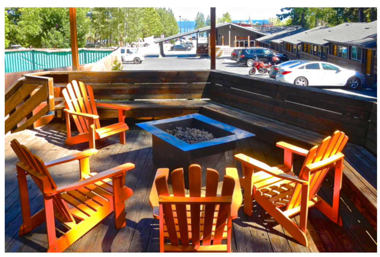
Basecamp Hotel has several areas to relax beyond one's room.

There's another communal outdoor area off the lobby area. And the lobby is much more than that. It's like a shared family room with big screen televisions and board games.