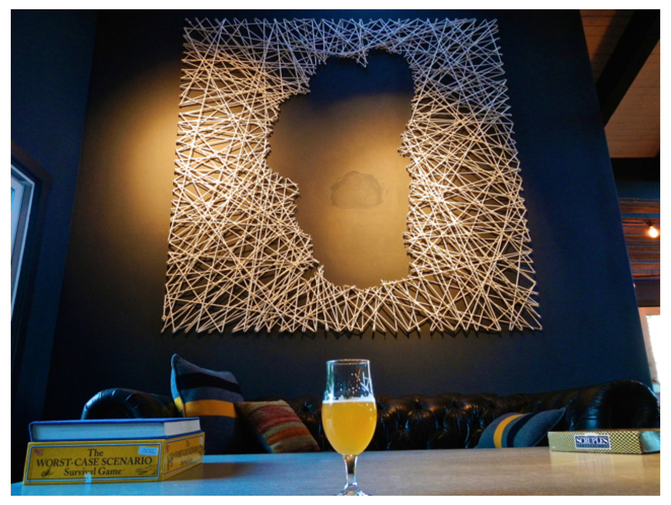
The communal space is ideal for relaxing and having a glass of beer or wine that the hotel sells.

It was nice not to have the standard photos of Tahoe in the room. The wall hanging above the bed had key attractions pointed with an outline of the lake in the center. Where Sand Harbor is it says "swim suits galore", between here and Truckee says "people floating down the river w/beer", while on the West Shore it says "fancy pants boats".