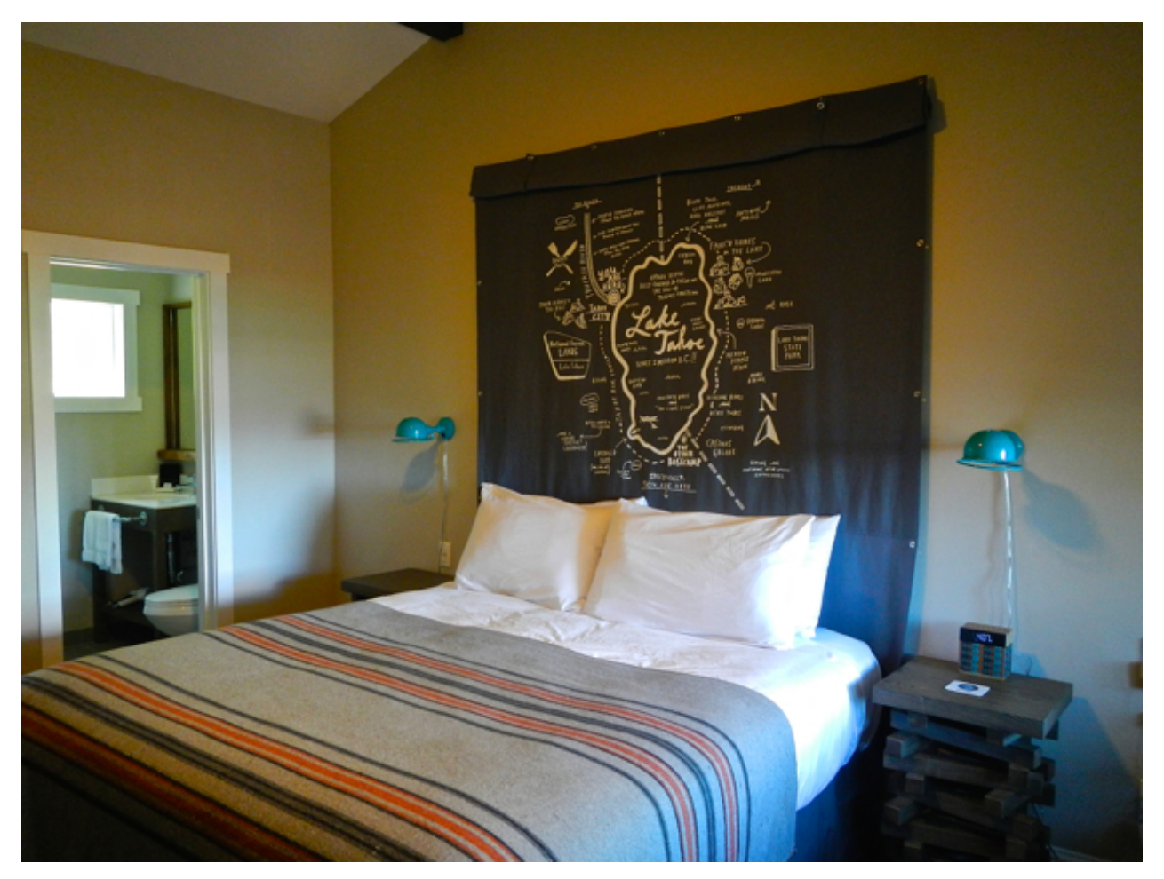
Basecamp Hotel Tahoe City is comfortable without frills.

It's hard to recognize this was once the Aviva Inn. The 24 rooms have been gutted — as well as the lobby and shared spaces. There are five room types, with a couple at the far end having limited views of Lake Tahoe. Rooms range from a spacious king to queen bunk to "great indoors family room". The latter has a king bed, tent, faux fire pit and stars on the ceiling.