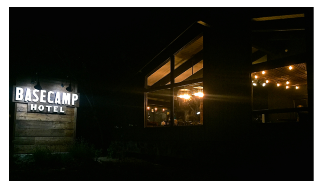
Basecamp has hotels in Tahoe City, South Lake Tahoe and Boulder.