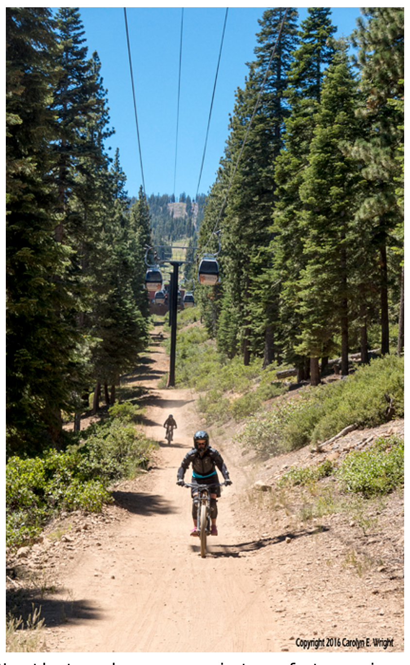
Northstar has a variety of terrain -

Then people are divvied up in groups based on skill level. The mountain's routes are divided into green (easy), blue (intermediate) and black (advanced) just like ski runs.