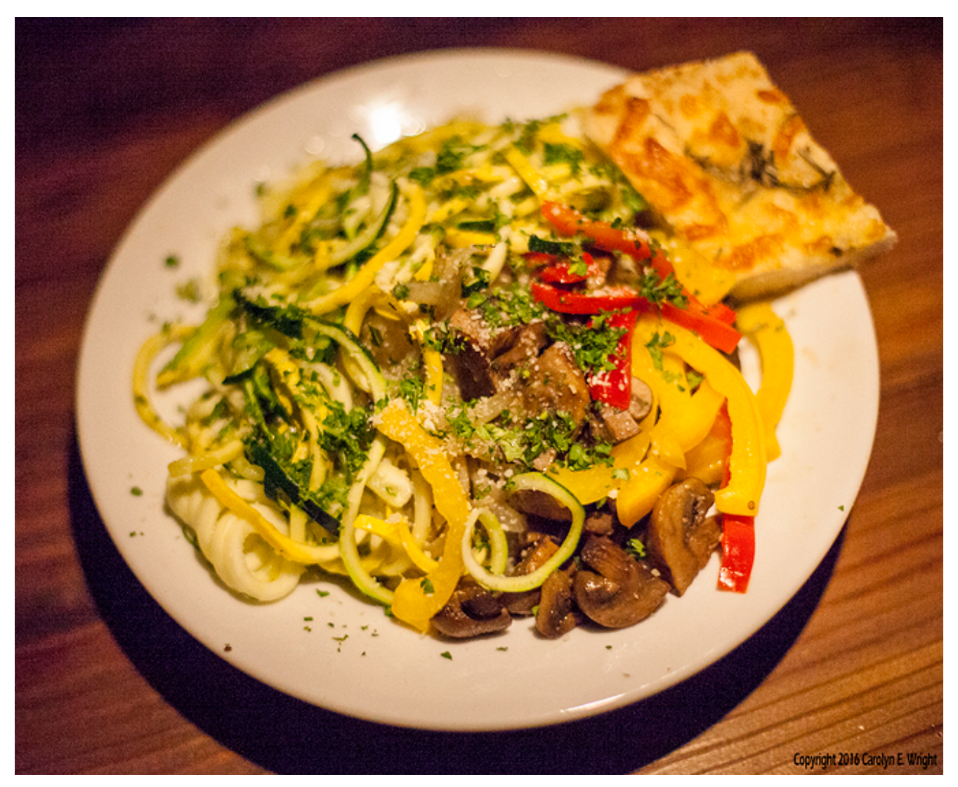
The vegetable risotto is off-the-charts good, and definitely filling.

This was one of the best risottos I've ever had. So often I'm left wondering where the vegetables are and if I just consumed a block of cheese. And while this was rich, there was also a lot to it. It would be easy to just order this and no starters and still be satisfied. A long grain is used, which is traditional for the region of Italy from which the chef hails.