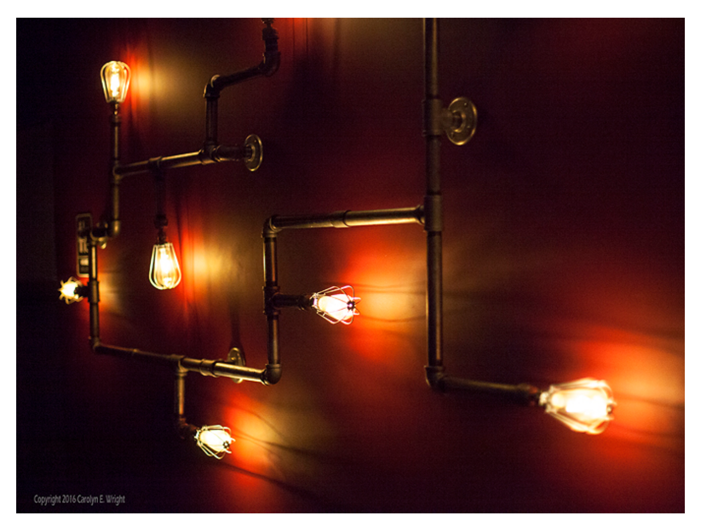
Lighting doubles as artwork.

It took about $1 million to transform the vacant area in the Heavenly Village into what has already become a destination for locals and tourists.