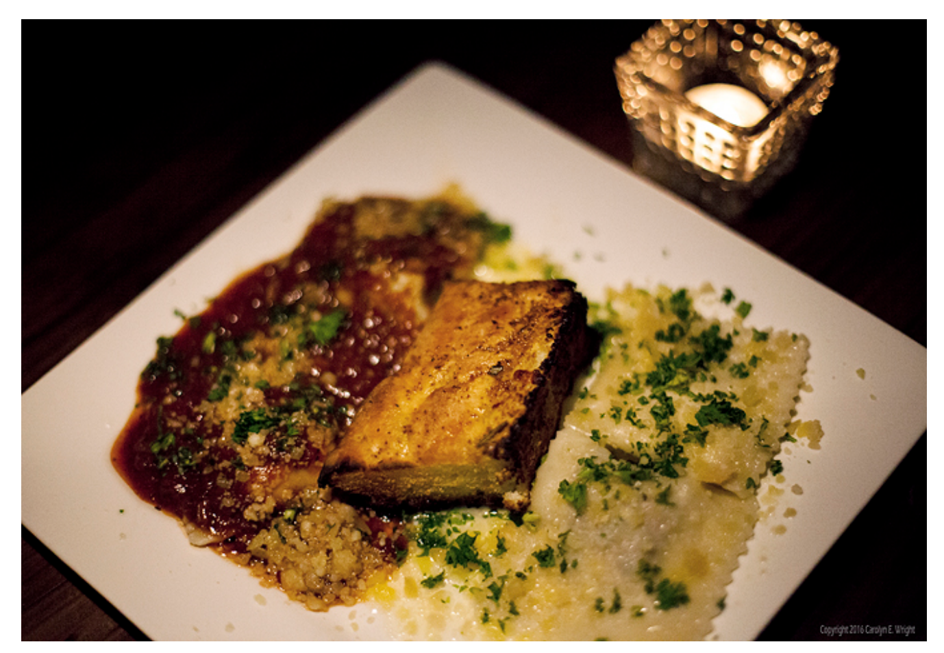
The ravioli sampler is a great start to a delicious dinner.

The menu is divided into Appetizers, Salad, Soup, Pasta, Risotto Bowls, and Kids. The ravioli sampler is worth splitting. It's possible to get ones filled with cheese or sausage, then covered in butter and cheese, and/or marinara sauce. This sauce is better known as the chef's prized gravy.