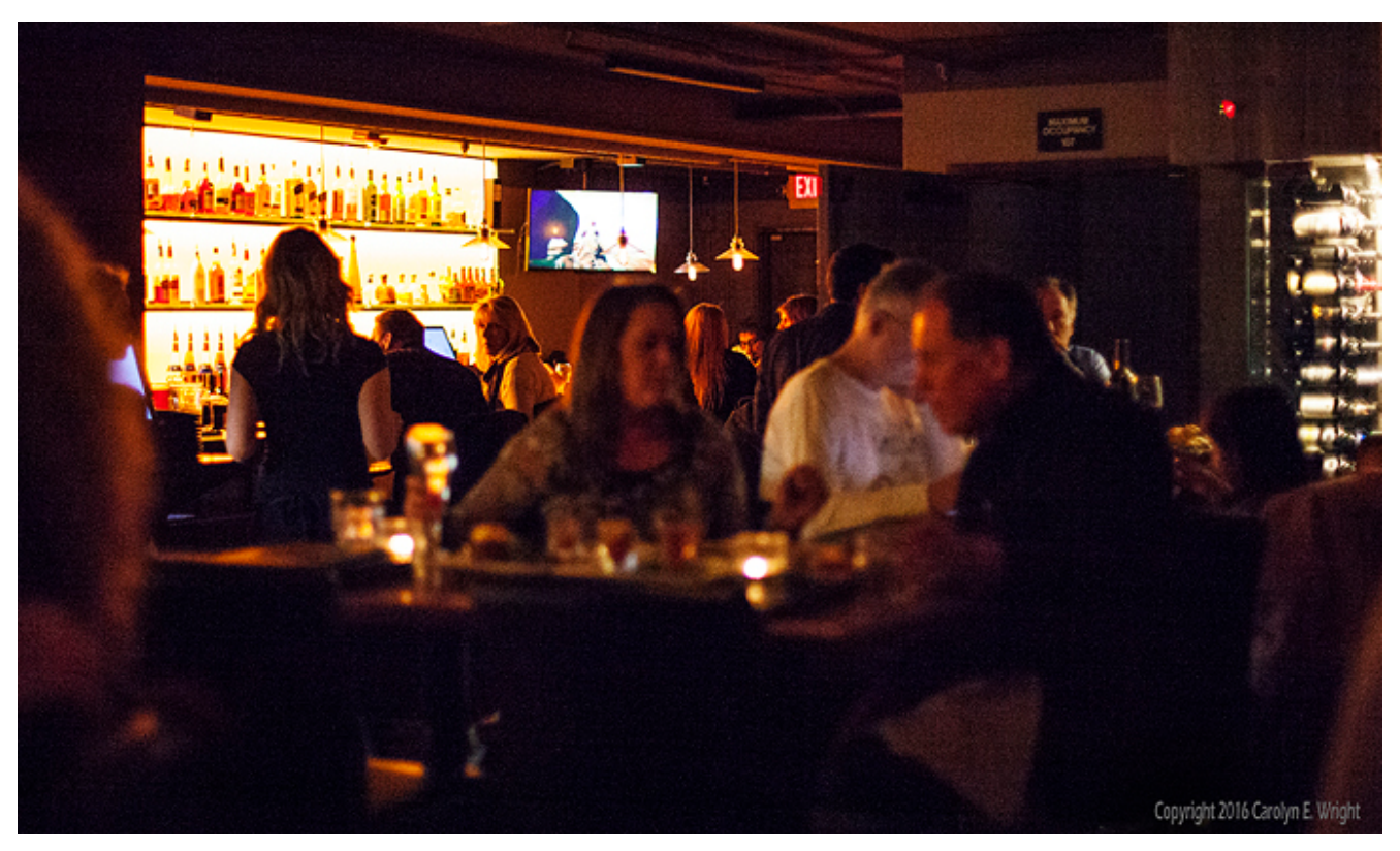
A mix of seating choices makes The Loft inviting.

days of the week there is a special that involves discounts on food and beverages.