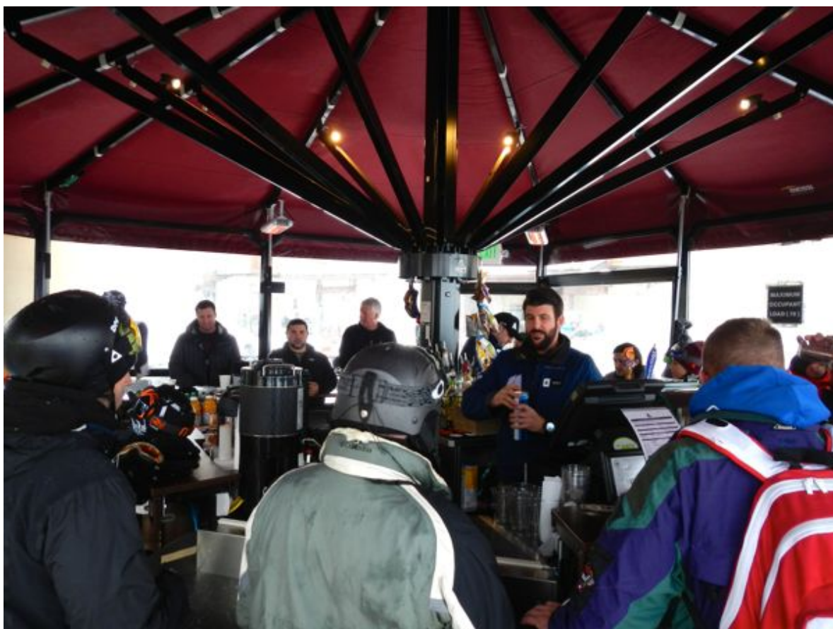
The K Bar in the plaza has views of the upper mountain.

Even though Vail Resorts releases the dollar figure for improvements at other resorts, Kirkwood officials were not forthcoming with the amount invested at their resort; only saying it's been in the millions.