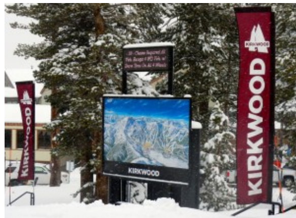
Signs alert riders to what is open.

"No (big) changes (to the character) are why we keep coming back. We've been coming here as a family since the '70s. It's all about the skiing," Simon said, while walking up to the bar table. The bar was picking up about 11am during a snowstorm with skiers and boarders seeking refuge and libations.