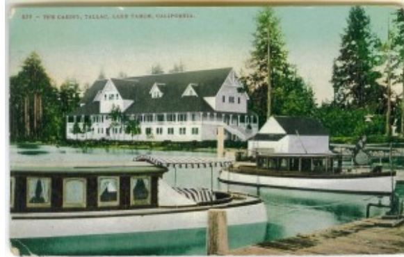
A 1908 hand-colored postcard of the Tallac House.