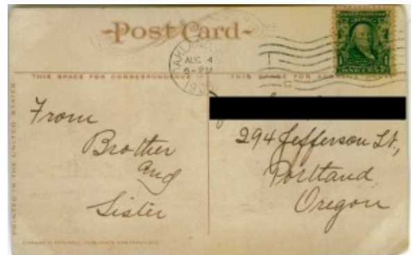
The same card postmarked at 5pm Aug. 4, 1908.

Elias "Lucky" Baldwin opened his opulent Tallac House and Casino near Mount Tallac on the South Shore in 1899. It stood 3½ stories.