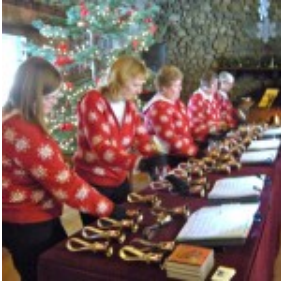
Bell ringers at Valhalla.

The annual holiday fair at Valhalla near Camp Richardson on the